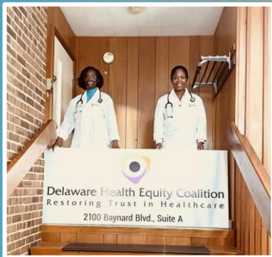
Delaware Health Equity Coalition, Primary Care Practice opening (2022 Standard)