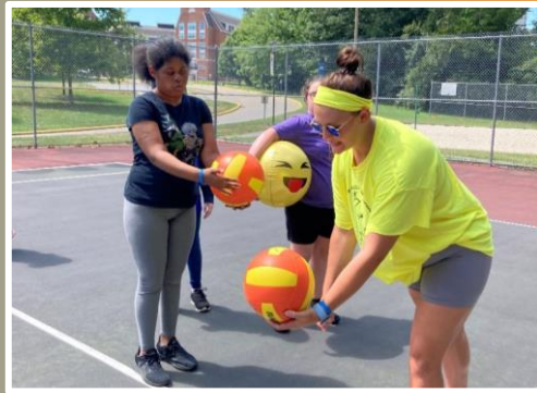
Tether Foundation, Camp Abilities sports program for visually impaired youth (2022 Small)