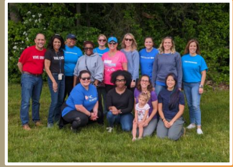
Highmark Delaware BluePrints funded the United Way Born Learning trail at Glasgow Park. Highmark DE team members volunteered to replace signage and paint the trail.